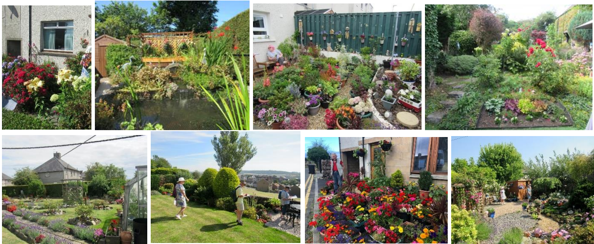
Photos above of some of the gardens judged in 2022

Garden Competition: We revived the town's much missed Garden Competition in August 2021. The competition got bigger and better in 2022 as we also resurrected the Flower Show.